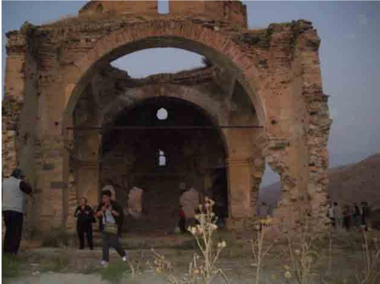
Palu Armenian church