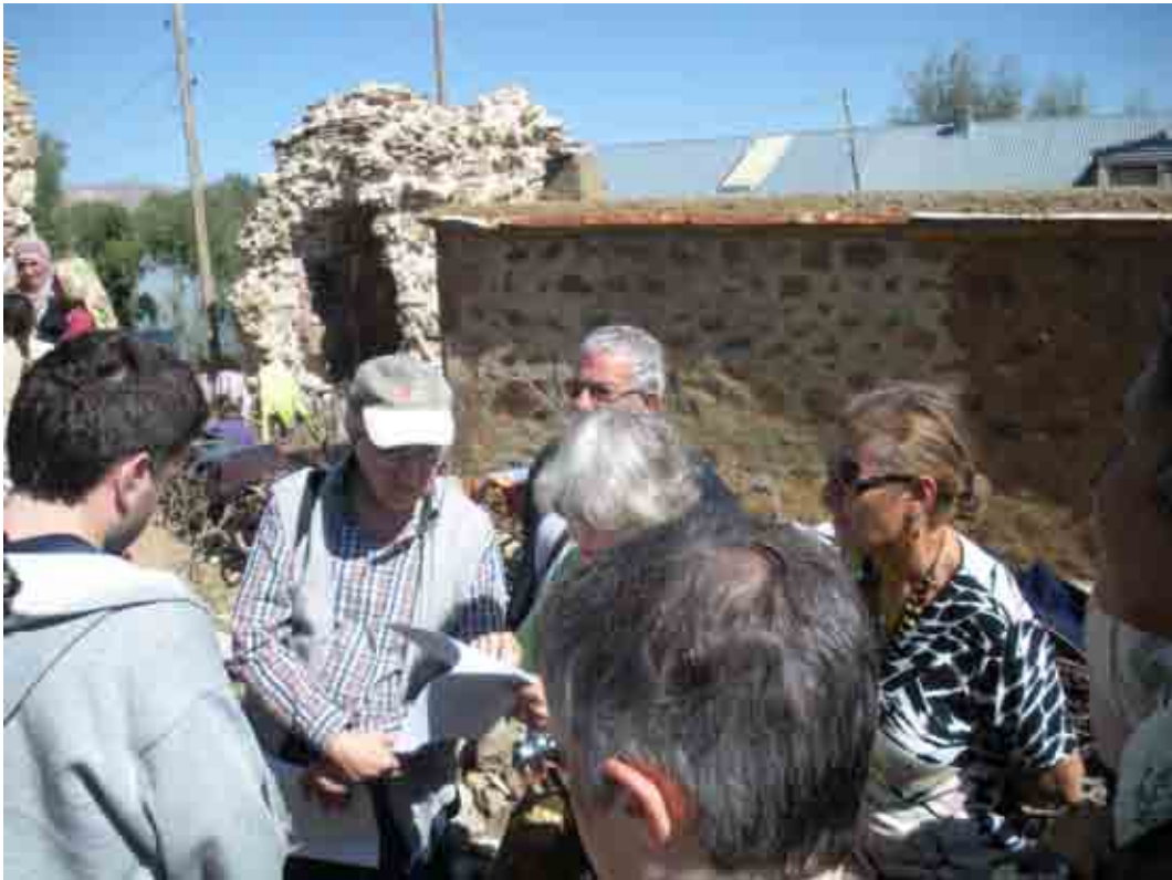
Anahit Der Minasyan votive offering at Surp Garabet Monastery