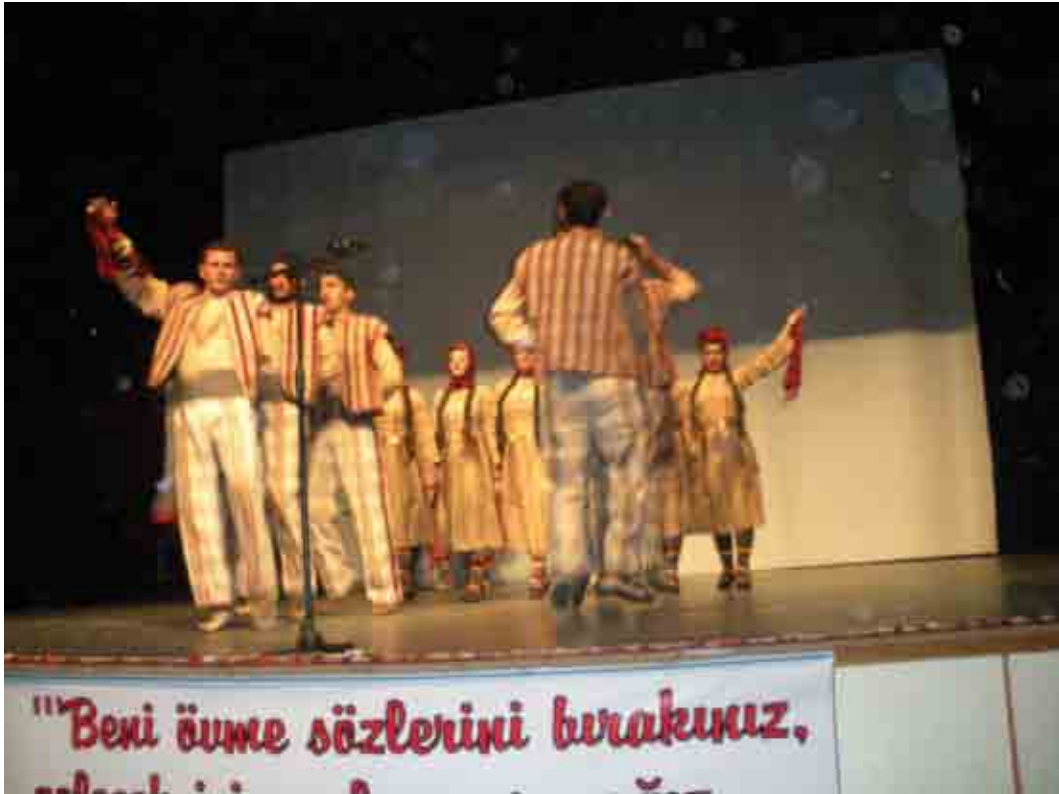
Mush Cultural Affairs Office: : Sason Armenian folk dance group