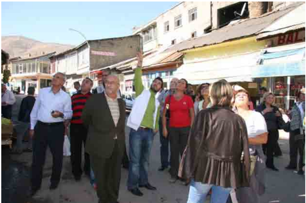
Excursion in Mush