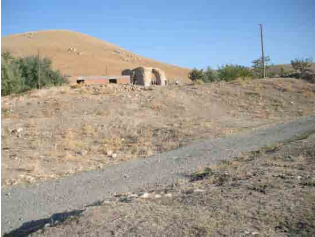
Elaziğ former Habap (Ekinözü) village church remains (Mother Mary)