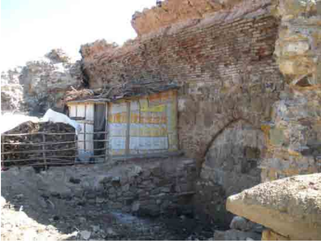
Remains of Surp Garabet Church