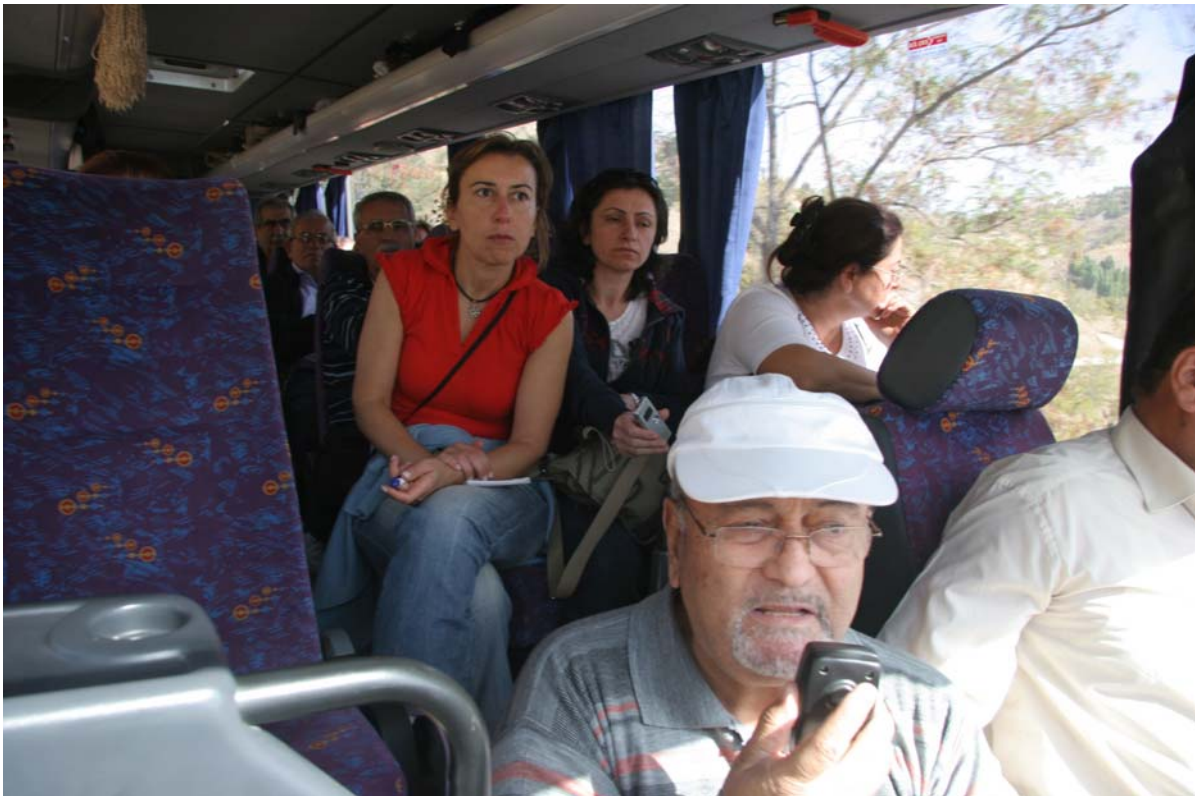
The writer is a civil engineer with great interest in Urartu and Roman water structures.