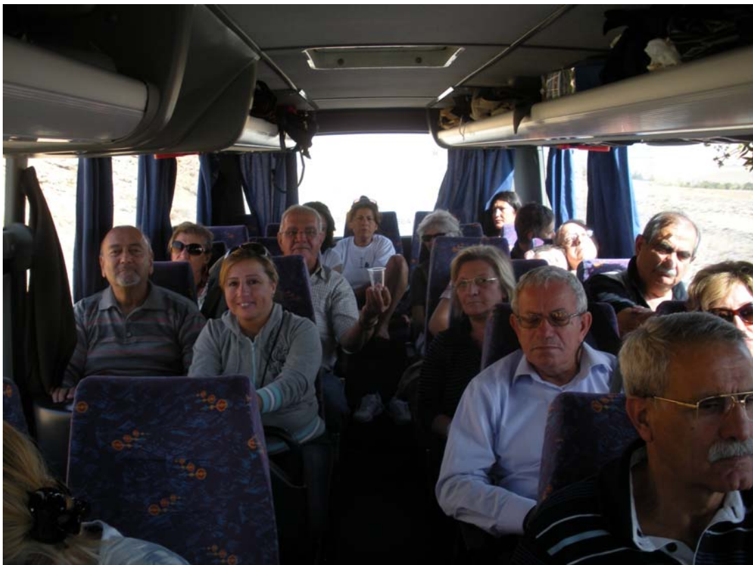
Scenes from trip