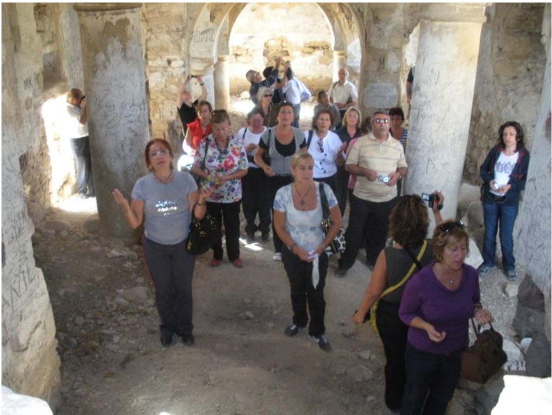
Prayer for a famous Armenian theater critic Agop Ayvaz