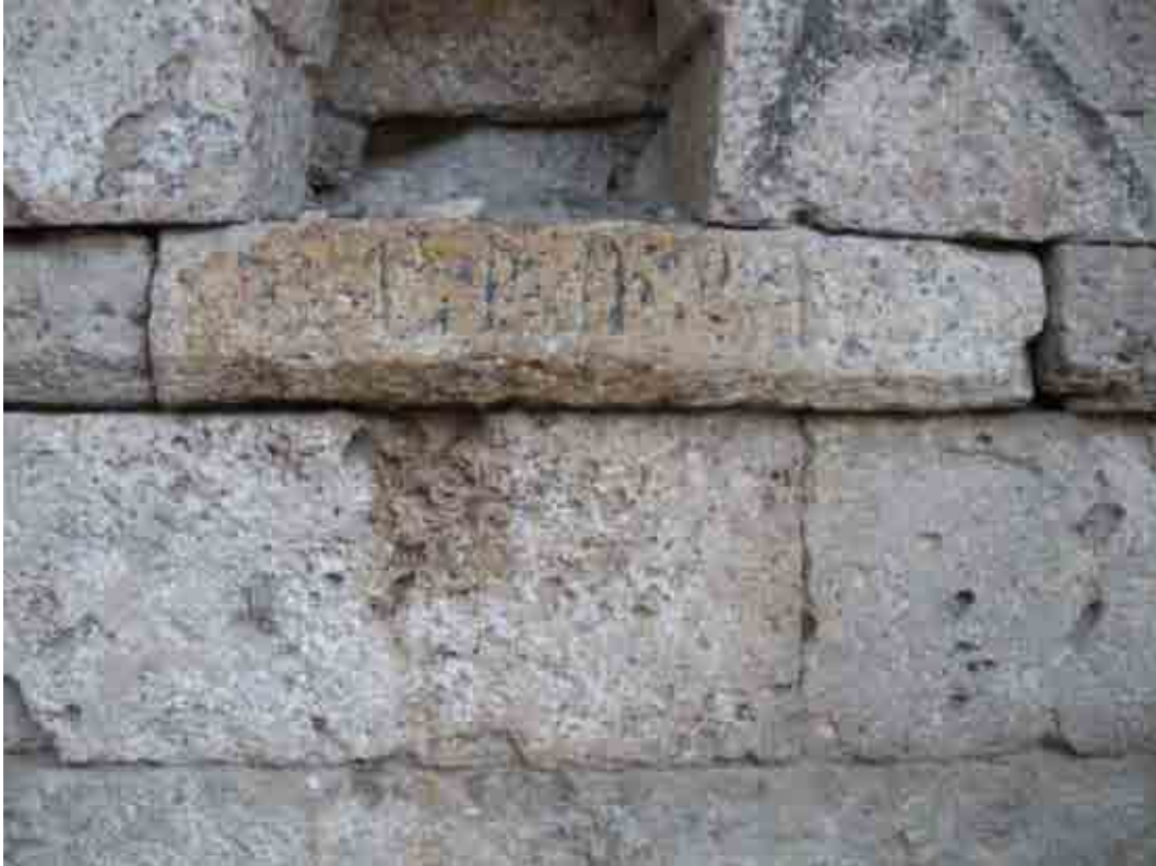
Habap (Ekinözü) village fountain epigraph