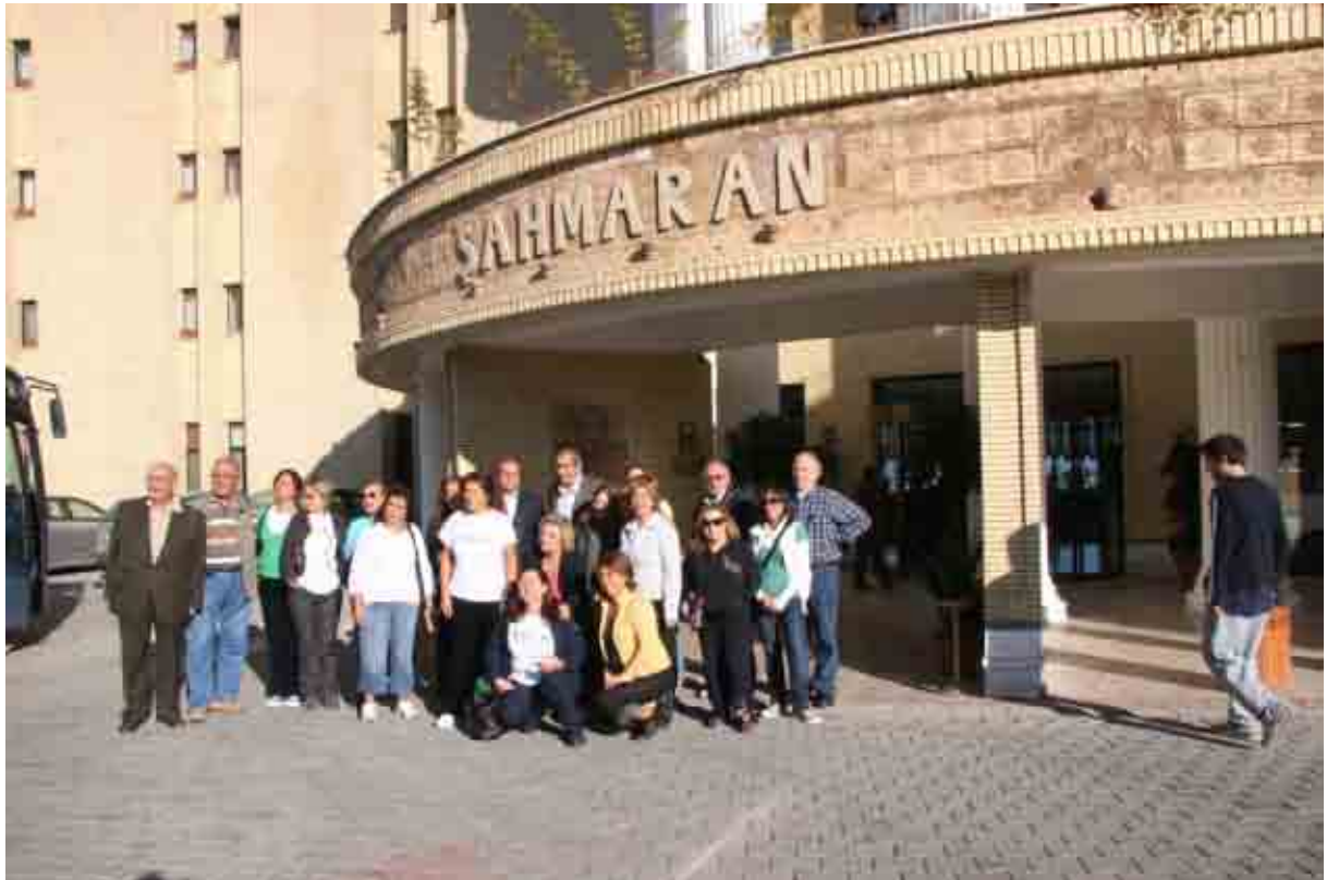
Our first night hotel Şahmaran Oteli in Van