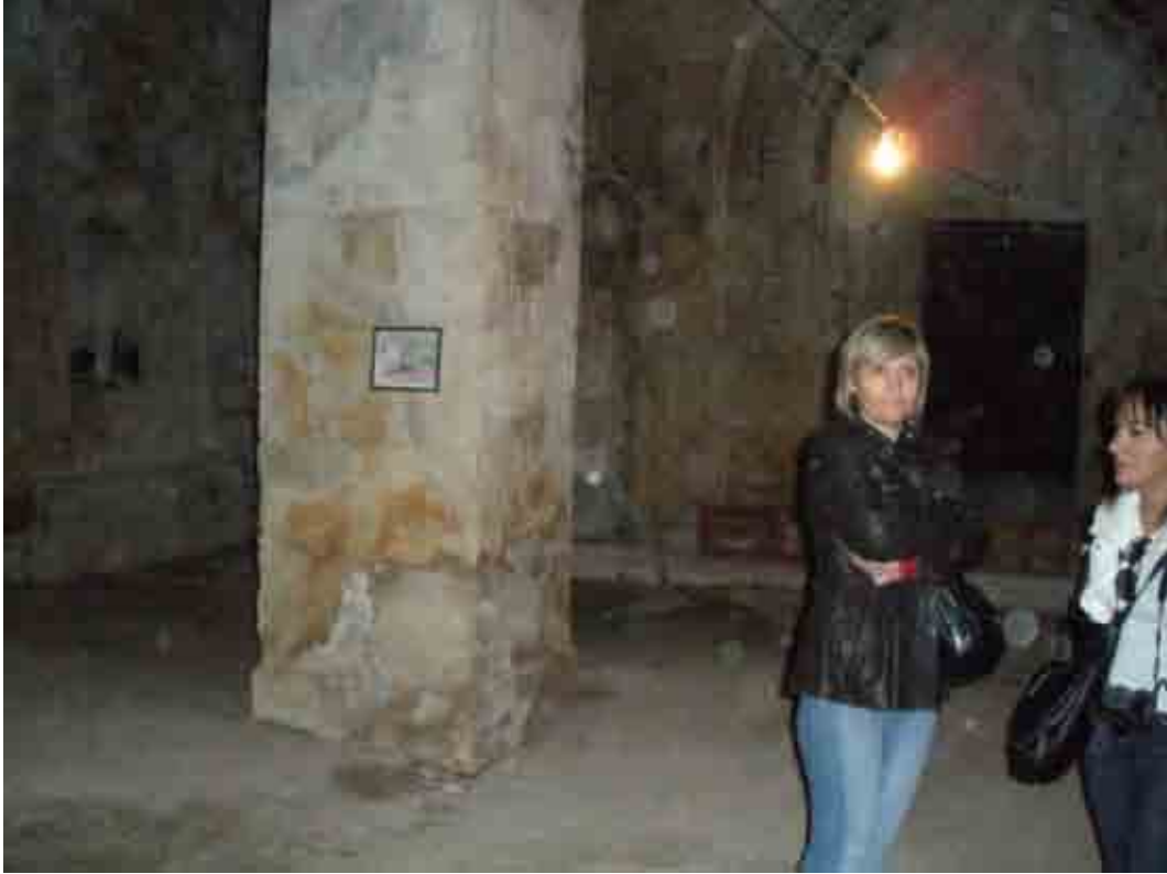
Inside Erek Mountain Monastery (Varaka Vank) or 7 churches