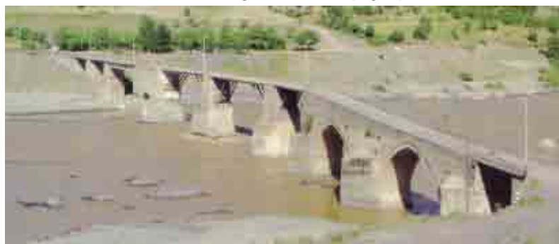
Palu'da historic bridge