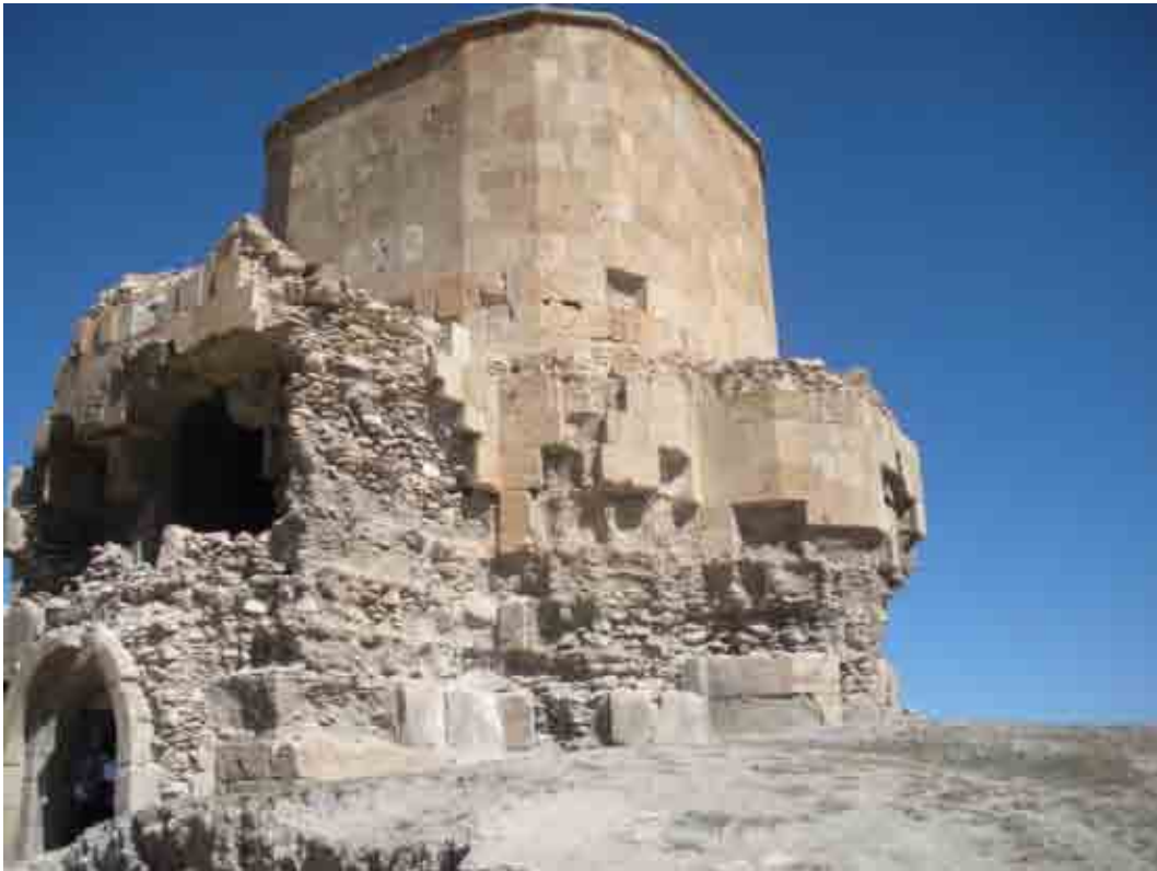
Very close to Iran border, Sorader (Red Church, Kızıl Kilise) monastery. Interesting architecture