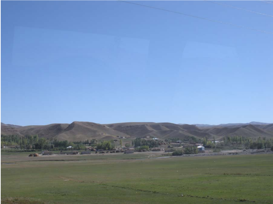
Close to Iran border, Urartu era Gelincik dam(filled )